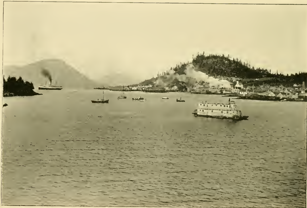
Fort Wrangel, showing Town and Bay.